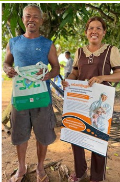
Distribution of AMR awareness posters to pig farmers in Kep province in Cambodia