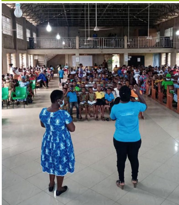
World AMR Awareness Week campaign in Ghana