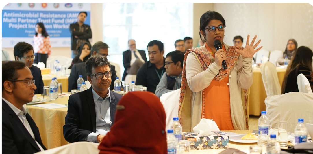
AMR MPTF Project Inception Workshop in Bangladesh

In 2023, 14 countries were implementing projects supported by the MPTF, including four new countries – Bangladesh, Madagascar, Mongolia, and Tunisia. The expansion of this work over the past few years has raised questions regarding the Fund’s future strategic direction, its role in the One Health response to AMR and the selection criteria and process for new countries to apply for funding.