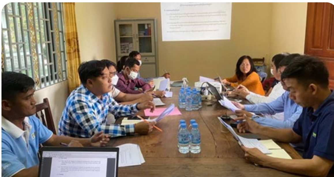
The participatory meeting at sub-national level to validate the practicality of the treatment guidelines in Cambodia