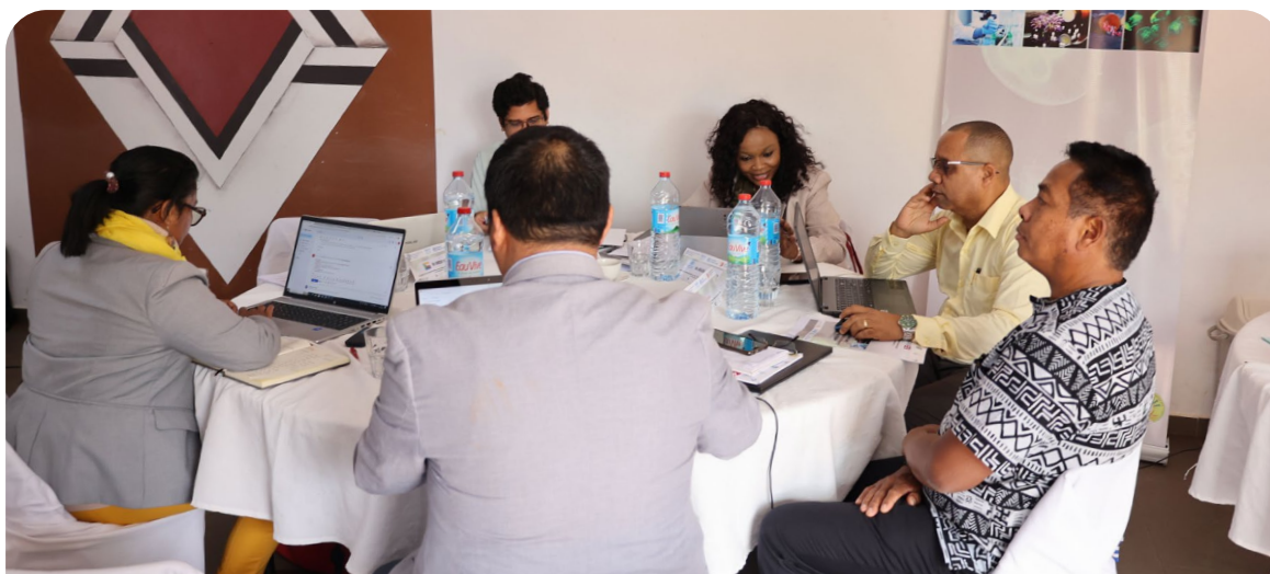
Leadership retreat in Madagascar

A May 2023 event in Indonesia focused on AMR in the environment, supported by the Global Environment component. Involving key stakeholders in the fields of AMR and environmental health, it aimed to integrate AMR in the environment into the upcoming NAP. Recommendations included: strengthening the engagement of the Ministry of Environment and Forestry in AMR surveillance; the development of a policy paper by all ministries participating in the NAP to outline their roles and actions regarding AMR in the environment; and incorporating environment into the NAP by focusing on prevention, control, and surveillance.