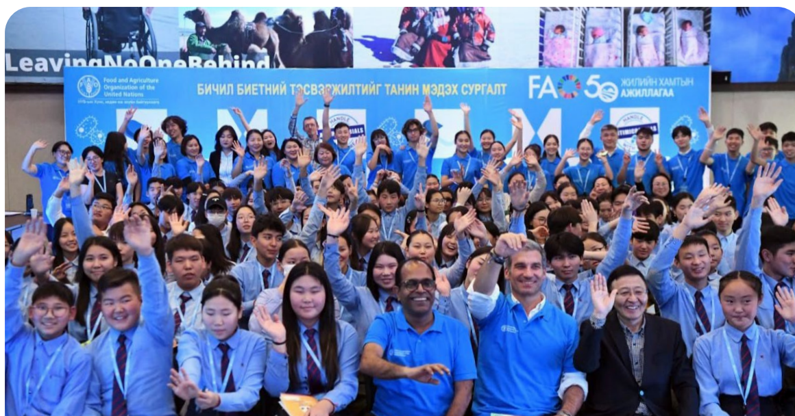
World AMR Awareness Week 2023 Campaign in Mongolia