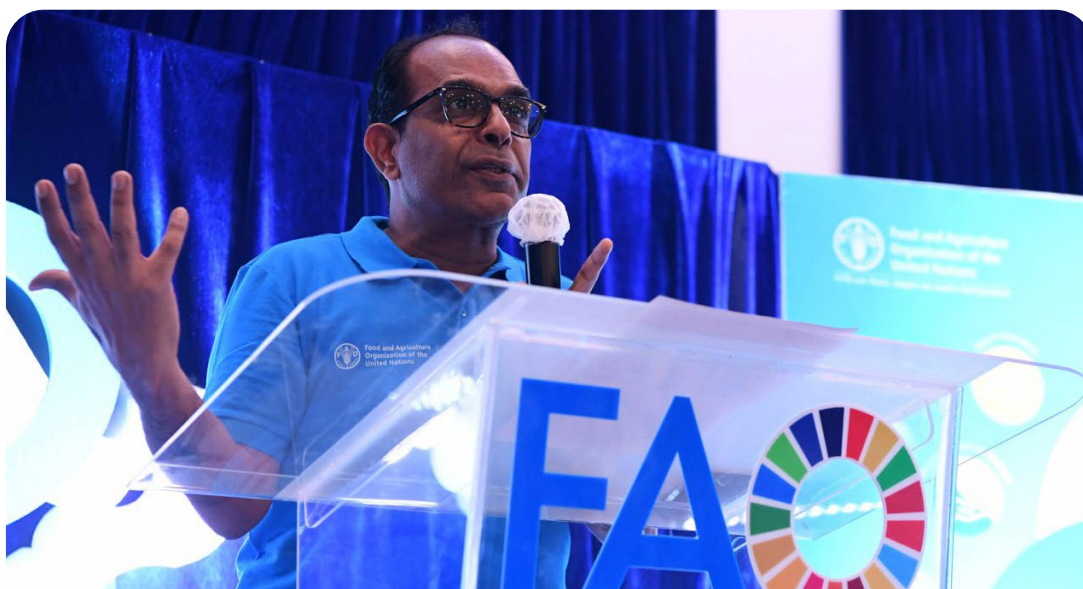
World AMR Awareness Week 2023 Campaign in Mongolia

For a detailed overview of the MPTF Financial Situation, refer to the 2023 Annual Financial Report, which will be shared with partners.