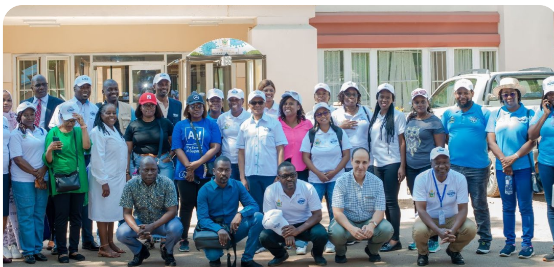
Veterinary Training in Zimbabwe

In 2023 the GISSA platform was ready for deployment pending: the decision on a name change from TISSA to GISSA, to reflect the addition of UNEP into the Quadripartite (thereby removing 'Tripartite' from the name); the integration of environment data into the system; and future governance and funding of the platform.