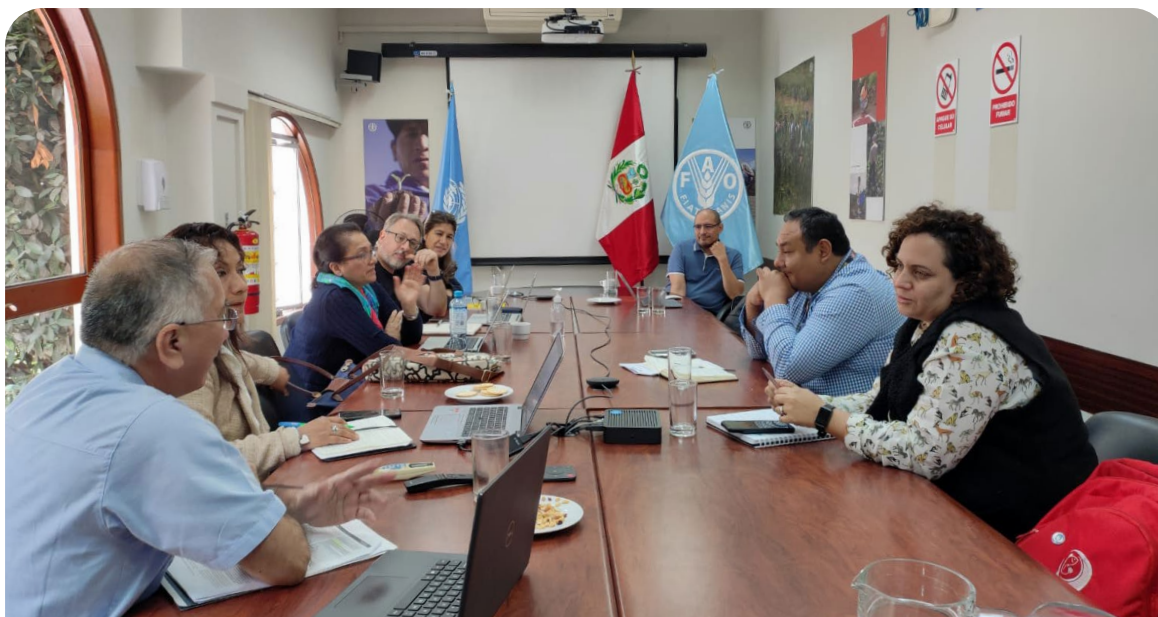
Implementation Committee in Peru