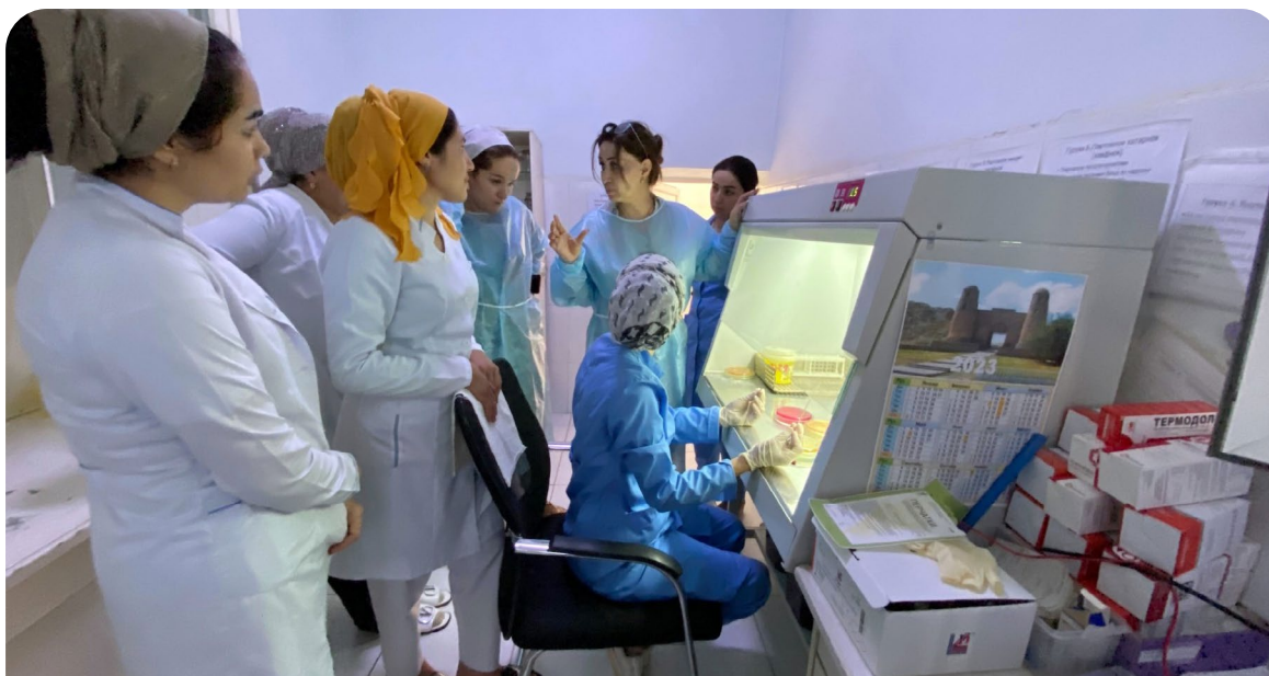
Training and experience exchanging on the sequencing of the genomes (Tajikistan)