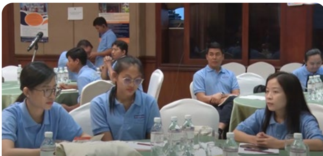
Warm-up event for WAAW in Phnom Penh on 6 October 2023, targeting university students (Cambodia)

Progress made towards the outputs of both the country projects and Global Programme components is summarized in Table 1, and detailed below by Results Matrix Output (the Results Matrix is shown in Figure 2). One-page profiles of each country project and Global Programme components can be found in Annex 2.