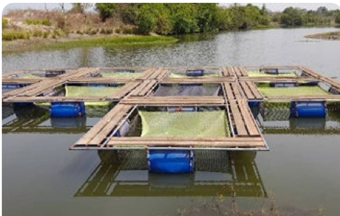
Floating fish farm, Senegal

The advocacy and communication on MPTF are being promoted with the increase in visibility through the AMR QJS website launched by QJS in 2023 and through multiple events leading to UNGA HLM advocating MPTF as a potential funding mechanism to AMR response.