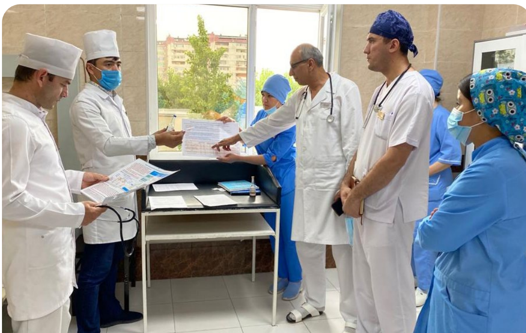
Laboratory in Tajikistan

Providing resources to support MPTF activities at the country level enabled the M&E component to strengthen global outputs, including implementation of the GAP on AMR. By driving the implementation of both the global and national M&E frameworks simultaneously, the Global M&E component contributed high-quality evidence for improved decision making and advocacy across countries. This included targeted training on performance management for the implementation of the multi-sectoral NAPs, development of M&E guidance (downloaded 1,030 times as of December 2023), TrACSS reports providing a snapshot of AMR NAP implementation and trends across sectors, an e-Learning programme on M&E frameworks and support on M&E of MPTF-supported country projects.